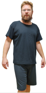
YSHIELD® TBT + TBH